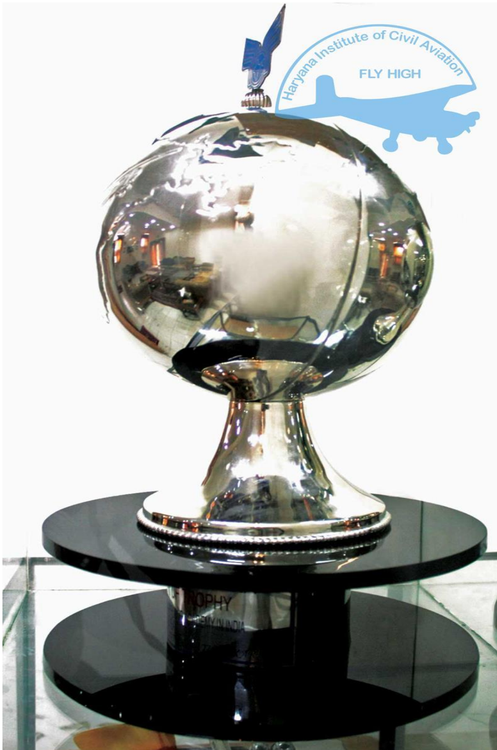
2nd Best Flying Institute - Awarded by AERO CLUB of INDIA