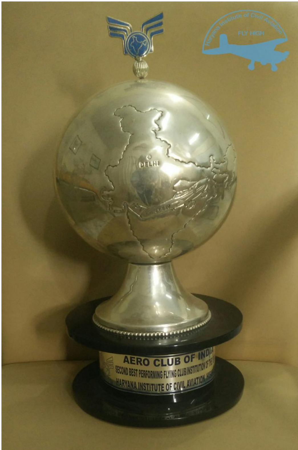
2nd Best Flying Institute - Awarded by AERO CLUB of INDIA