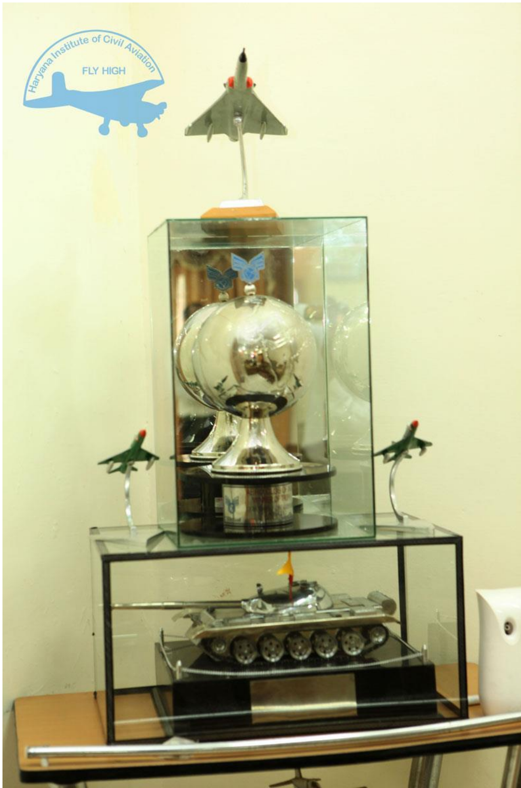
2nd Best Flying Institute - Awarded by AERO CLUB of INDIA