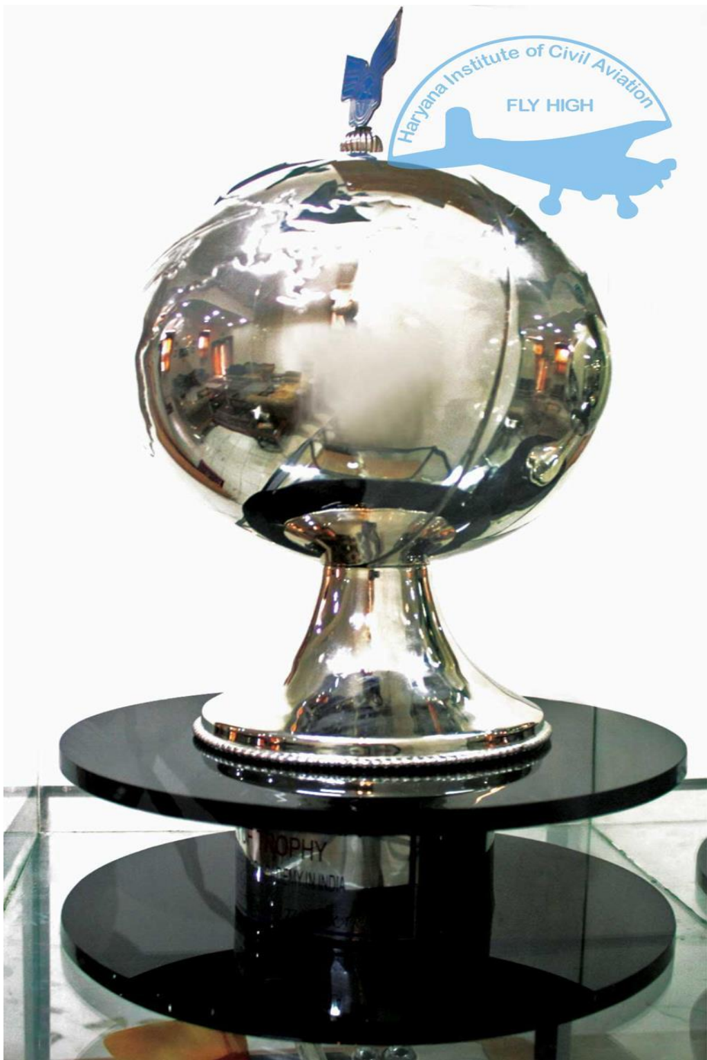
2nd Best Flying Institute - Awarded by AERO CLUB of INDIA